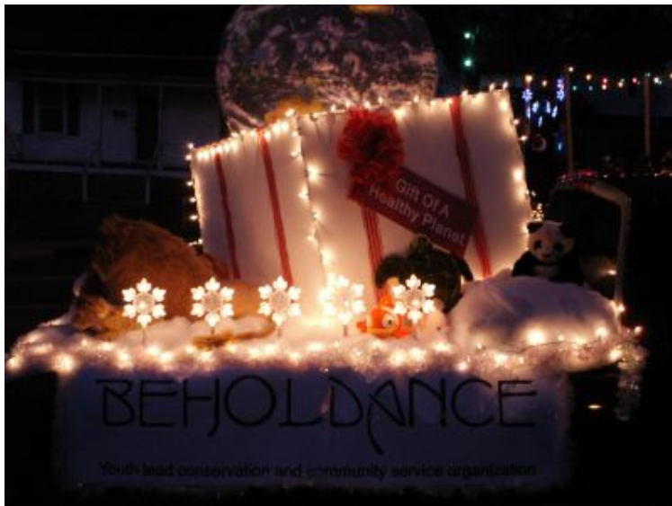
Beholdance 2008 Entry for the Kannapolis Holiday Parade.