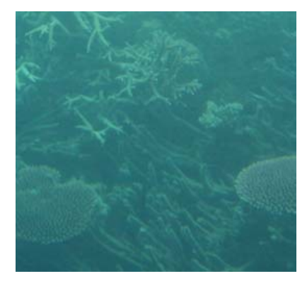
Actual picture taken from the sub of the Great Barrier Reef.

Our Tropical Forest and Coral Reefs are struggling. They are home to many of our unique and important plants and animals. A new bill is being presented soon and I want to urge all of you to write your state representatives. Please help by urging your senators to pass the 'Tropical Forest and Coral Reef Act'. It would provide funding for the protection of the forest and reefs around the US. Recently, the new NOAA health analysis stated that the reefs that are parallel to heavily populated areas are facing hardships from human impact. NOAA ranks the US coral reefs as "POOR" and "FAIR".