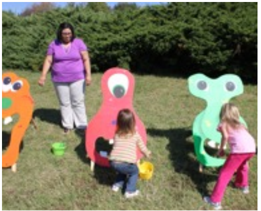
Saturday, October 8, 2011 - Beholdance youth participated at the Kannapolis Fire Department Open House greeting over 150 youth visiting for the event.

The team enjoyed meeting the youth in the community and talking to them about environmental concerns in our area. It was a great way to spend the day playing games and making your own fire trucks. Competition games against Fire Department Staff pulling hoses or moving a victim then ring a bell to win where a huge hit.