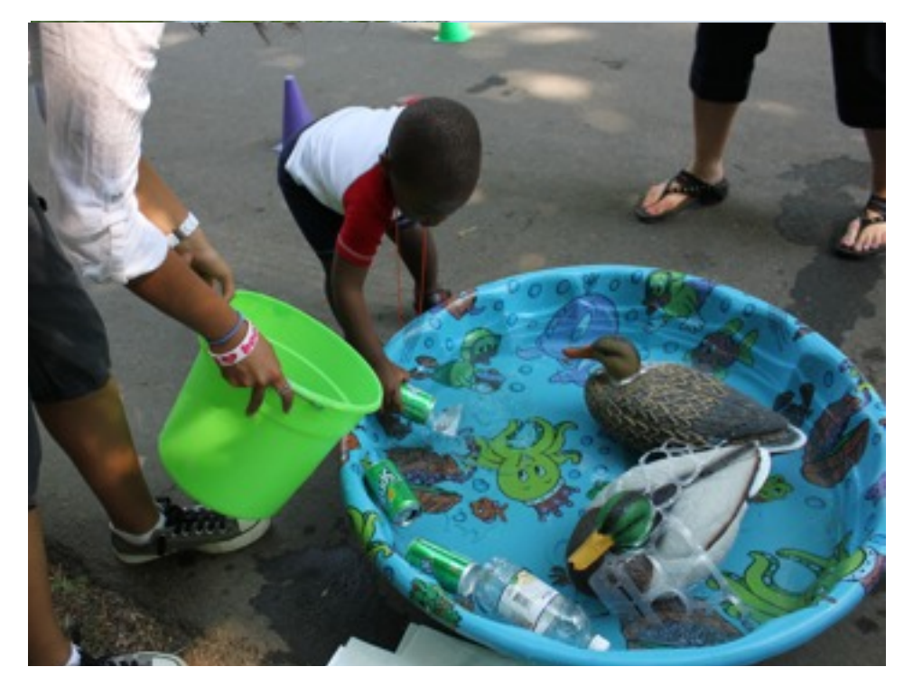
Youth Participating at Beholdance Save the Ducks Game Booth

Treat the earth well. It was not given to you by your parents, it was loaned to you by your children. We do not inherit the Earth from our Ancestors, we borrow it from our Children. Ancient Indian Proverb