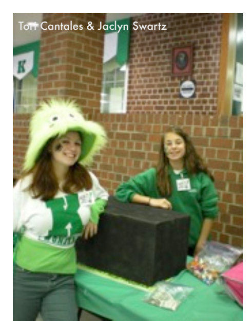
Yes, we said Spiders!

Beholdance teamed up with the Animal Career Exploration (ACE) Club at AL Brown High School for Spirit Week and hosted a Spider Sale to benefit Beholdance K9 Krunchies and Feline Munchies for senior's pets in need with Cabarrus Meals on Wheels (CMOW). For fun the group took advantage of the local rivalry between Kannapolis and Concord. The Wonders sold plastic spiders and candy. Students supporting the cause were asked to place their spiders into a three foot coffin that was delivered with the spiders, bug spray and other insect eradication items to Concord Spiders before the big football game.